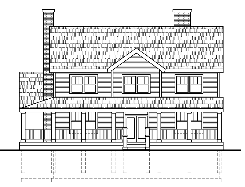
Exterior Elevation Created in Chapter 5, utilizing blocks, hatching, line weights and line types.